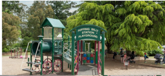
Community members gathered at Emerald's Hills Hub on Wednesday 22 February to discuss future plans for the park and playground space next to Puffing Billy Railway in the town.